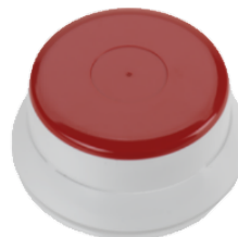
Red Blanking Cap