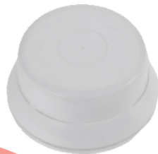
White Blanking Cap